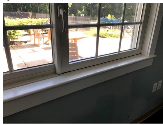
sliding window repaired