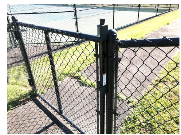
locking gate latch replaced