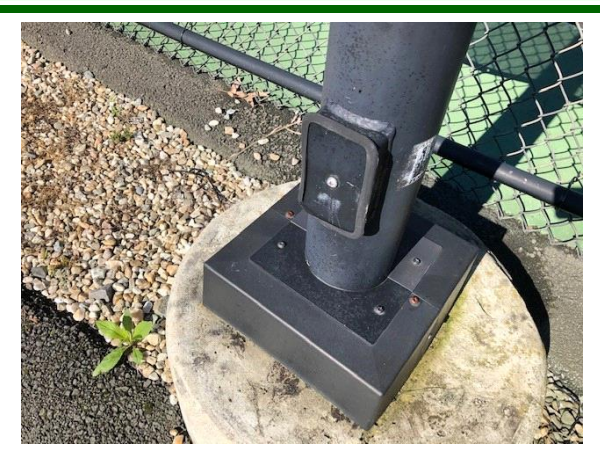
lights standard repaired