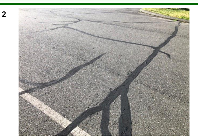
cracks have been sealed