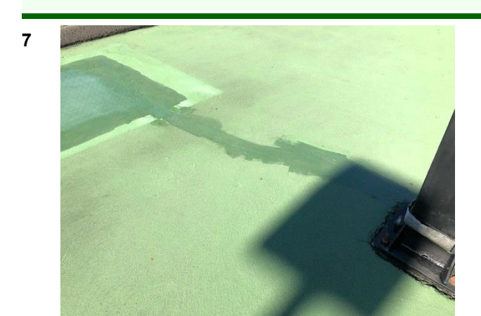
court surface repaired