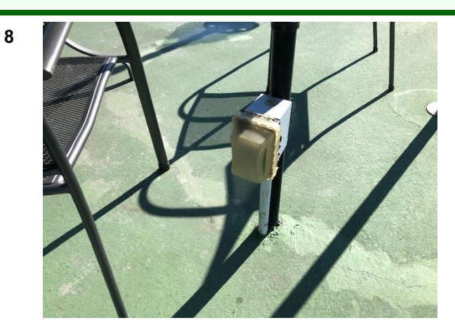
GFCI outlet & cover repaired