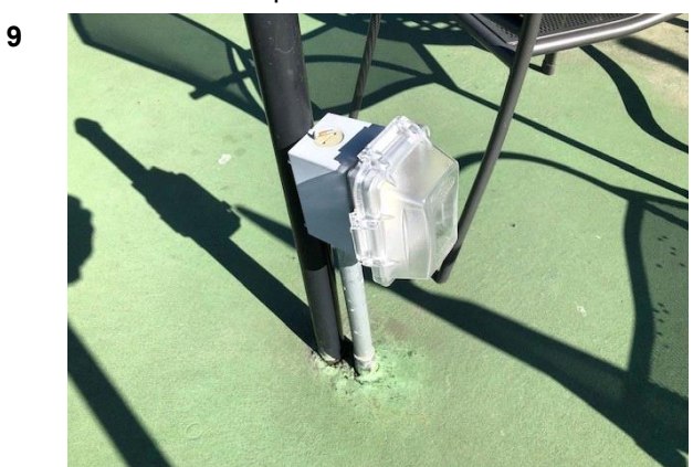
GFCI outlet & cover repaired