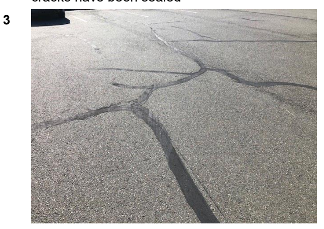
cracks have been sealed