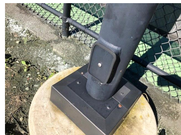
lights standard repaired