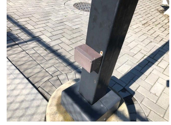
lights standard repaired