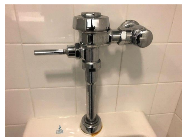
leaking flush valve repaired