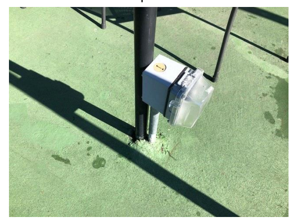
GFCI outlet & cover repaired