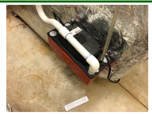
condensate pump replaced