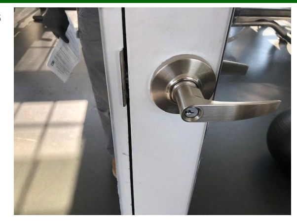
door latch repaired