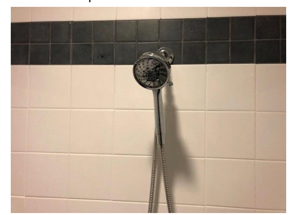
new shower head