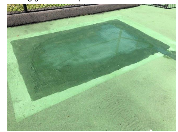
court surface repaired