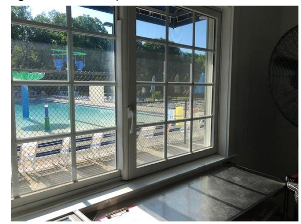
sliding window repaired