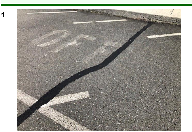
cracks have been sealed