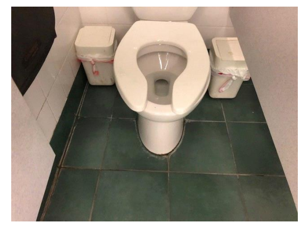
loose toilet repaired