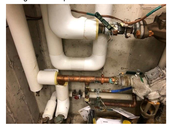
corrosion & leak repaired