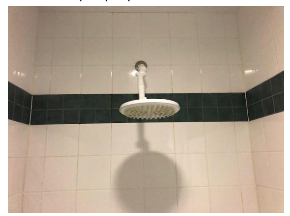
new shower head