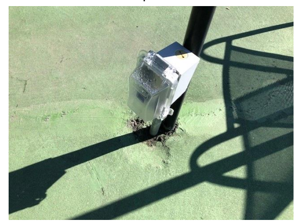
GFCI outlet & cover repaired