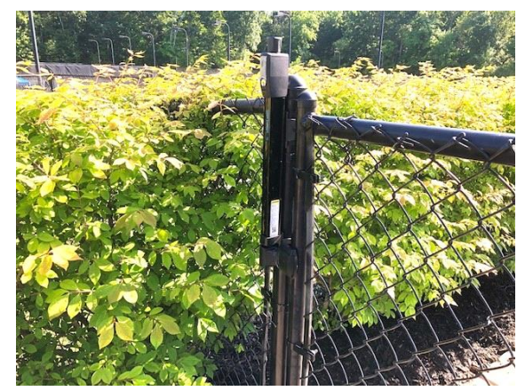
locking gate latch replaced