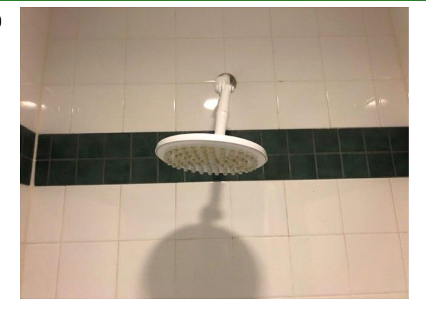
new shower head