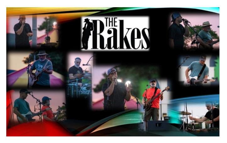
Monday, July 31 – 6:00 PM The Rakes

Join us for 4 evenings of great live music! Concerts are free and open to the public. All concerts will be at the Town Hall Green at 501 Main Street South.