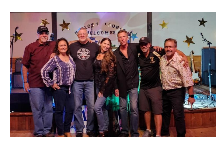
Monday, July 24 – 6:00 PM Clearview