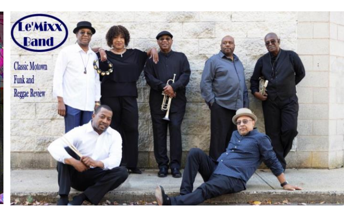
Monday, July 17 – 6:00 PM Le'Mixx Band